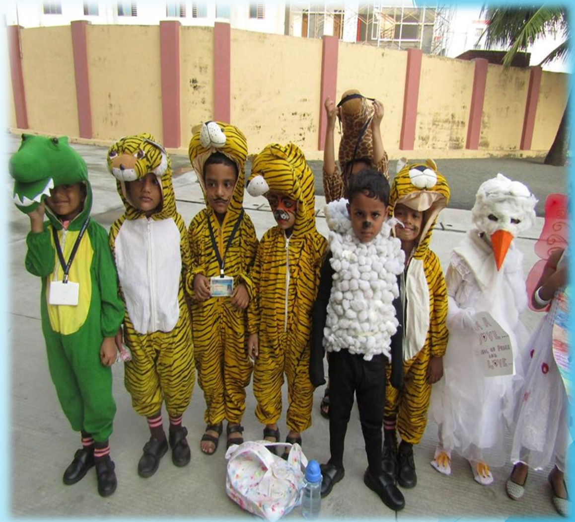
FANCY DRESS COMPETITION